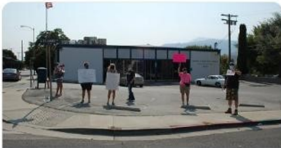
Protestors rally to save their post offices recordgazette.net

Record Gazette @RecordGazette · 1d Dozens rallied to the cause last weekend after the online MoveOn.org activist coalition championed nearly 700 such rallies nationwide aimed at "saving the postal system."